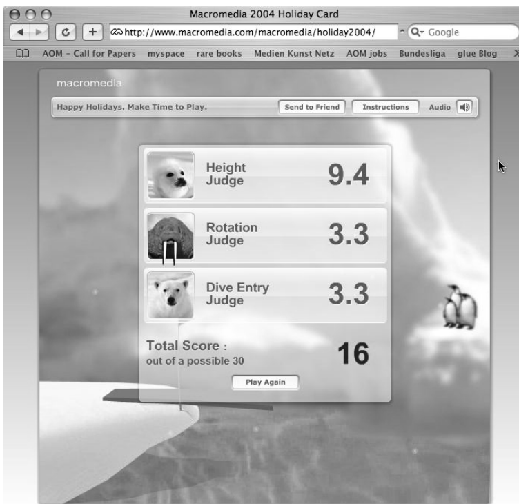
Figure 2: Online Game - Highscore