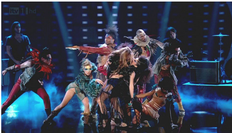
Figure 2 Britain's Got Talent (Gotty, 2010).

Cyrus embodies the song's theme through her dynamic and provocative choreography. She engages in energetic dancing and grinding movements with her backup dancers. Midway through the performance, she pulls one of the female dancers close, creating the appearance of simulating a kiss. The lyrics suggest Miley is not letting anyone prevent her from pursuing her desires. Similar to the TCA performance, the Britain's Got Talent performance drew some controversy. The media reported on the outrage of Miley supposedly 'making out' with a girl. This is seen in the news headlines at the time (Daily Mail, 2010). The controversy, rooted in homophobia, was based on one flash second of a simulated lesbian kiss, causing such a public reaction.