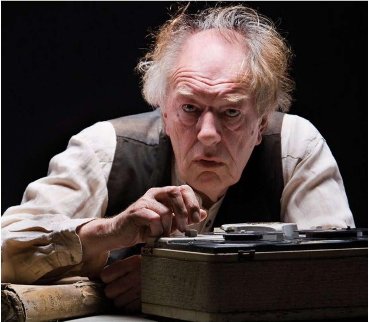
Michael Gambon as Krapp in the Gate Theatre production of 'Krapp's Last Tape' by Samuel Beckett.