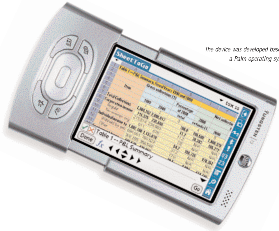
The device was developed based on a Palm operating system.