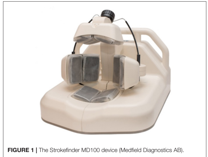
FIGURE 1 | The Strokefinder MD100 device (Medfield Diagnostics AB).

Transcranial Doppler ultrasound based technology measures cerebral blood flow velocity. The Lucid™ Robotic System using transcranial Doppler ultrasound (Neural Analytics, California, USA) has been reported to differentiate patients with LVOs with high sensitivity (100%) and specificity (86%) from healthy controls (51). It also showed 91% sensitivity and 85% specificity, when diagnosing LVOs in patients suspected to have stroke (51).