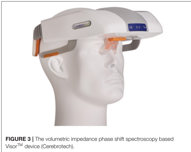
FIGURE 3 | The volumetric impedance phase shift spectroscopy based Visor™ device (Cerebrotech).

transducers positioned on each side of head. Each side has two individual transducers packed together, one element to transmit and the other to receive signal. SONAS® transmits ultrasound at a low, sub MHz frequency in an alternating fashion right vs. left. SONAS® measures brain perfusion in both hemispheres using microbubbles as acoustic tracers. Similar to MRI- or CT-Perfusion, the contrast agent is administered as a bolus injection. The change in microbubble related acoustic signal strength is monitored over time and displayed as bolus kinetic curves. This portable device is currently undergoing clinical trials (9).