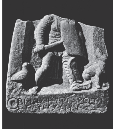
Fig. 1 : Gladiatorial grave stele from Hierapytna (originally published in Papadakis 1998: 81, fig. 515)

death, having defeated his adversary (Halbherr 1897: 236-38). 6 The inscription boasts that the gladiator was not subdued by a mere mortal but was overthrown by a destructive Fate ( ICret IV 374; Halbherr 1897: 237-38, no. 40); thus preserving the defeated (and deceased) combatant's virtus — a formula which is attested throughout the Roman world. 7 The use of the term deceptus was commonly used to convey the nature of undeserved, and perhaps unexpected, defeats (Potter 1999: 315).