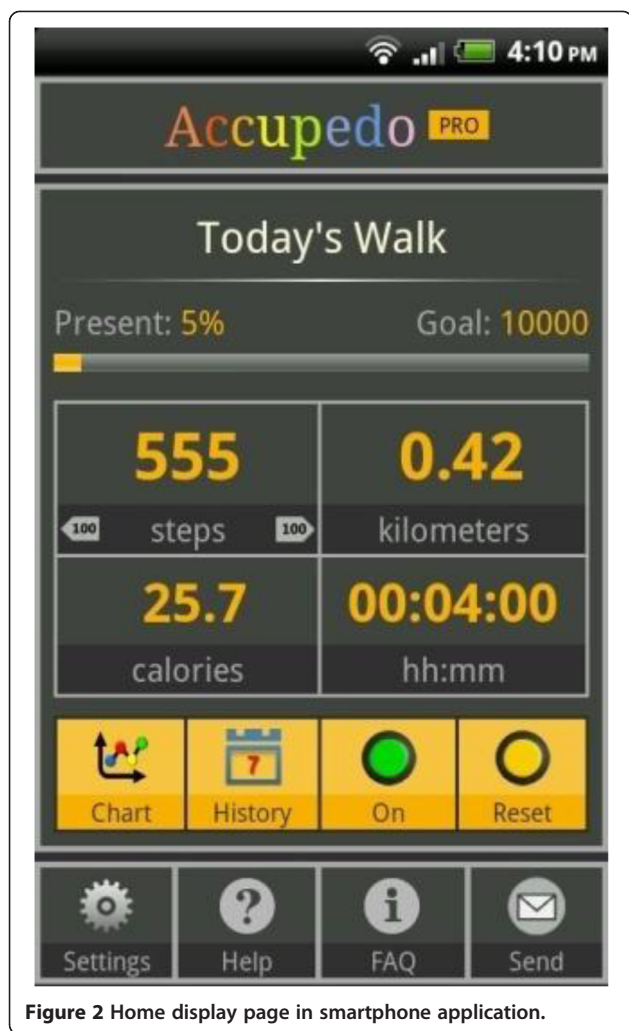
Figure 2 Home display page in smartphone application.