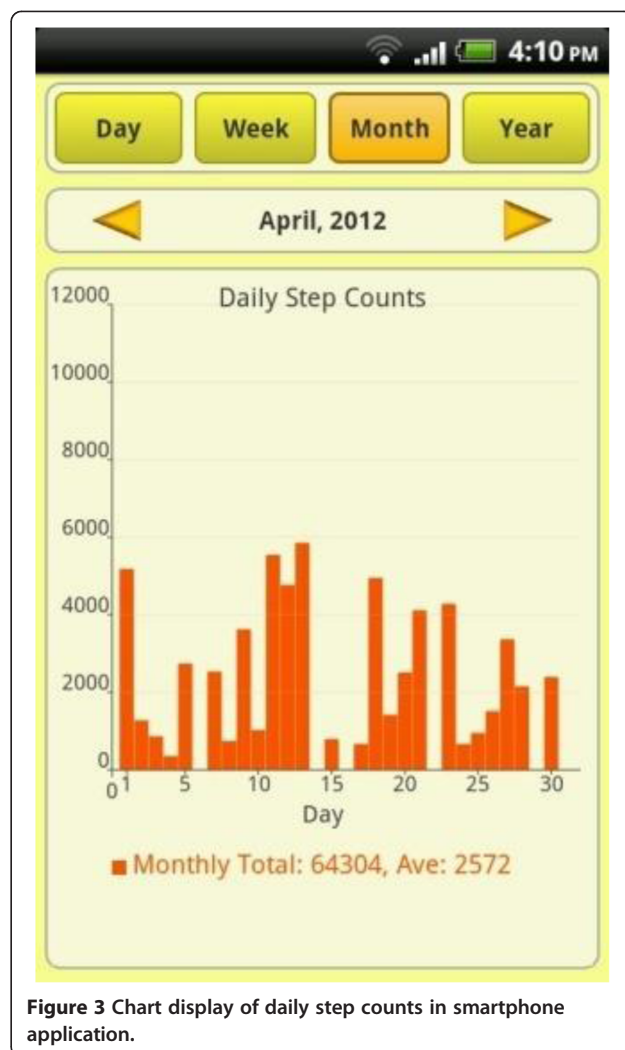
Figure 3 Chart display of daily step counts in smartphone application.

their phone charged and to always carry it during walking hours.