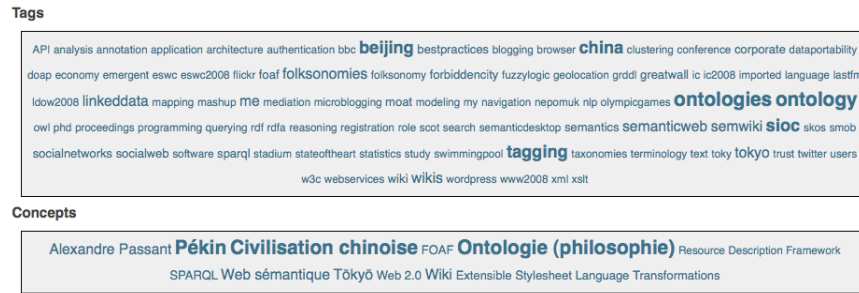
Fig. 3. Tagcloud and conceptcloud in LODr

related concepts by co-occurrence; (3) a list of related concepts that share a direct-relationship with the current one and (4) a list of related concepts that share a common property together. As Fig. 4 shows, SPARQL and XSLT are related since they share the dbpedia:Category:WorldWideWebConsortiumstandards value for skos:subject in DBpedia. For each cloud, we limit the list of URIs to the ones that are used in other tagging actions, to avoid information overload.