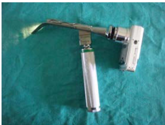
Figure 2 Photograph of the Truview® laryngoscope with camera attachment which clips onto eyepiece.

in a SimMan® manikin (Laerdal®, Kent, UK) in the following laryngoscopy scenarios: (1) normal airway in the supine position; and (2) following the application of a hard neck collar. A maximum of 3 intubation attempts were permitted with each device in each scenario. The primary endpoint was the duration of successful tracheal intubation attempts. The duration of each tracheal intubation attempt was defined as the time taken from insertion of the blade between the teeth until the ETT was deemed to be correctly positioned by each participant. Endotracheal tube placement was determined by each participant by direct visualization. Where the participant was unsure as to the position of the ETT, the time taken to connect the ETT to an Ambu® bag and inflate the lungs was also included in the duration of the attempt. In any case, after each intubation attempt an investigator verified the position of the ETT tip. A failed intubation attempt was defined as an attempt in which the trachea was not intubated, or where intubation of the trachea required greater than 60 seconds to perform.