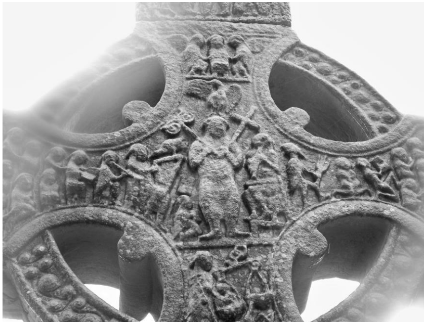
FIG. 4. THE LAST JUDGEMENT SCENE ON MUIREDACH’S CROSS (MONASTERBOICE).

Indeed, the scene corresponds perfectly to the description of the Last Judgement in Matthew 25: 31-46, where Christ separates ‘the sheep from the goats’: to his right, the blessed souls who will go to Heaven; to his left, the cursed ones who will fall into the eternal flames of Hell. In this context, the presence of the figure of David is justified by the fact that the Biblical king corresponds allegorically to Jesus Christ according to both the literal sense – as both came from the same stock, the stirps Jesse – and the figurative sense (David constitutes the prefiguration of Christ himself, being the one who foretold the coming of the Lord in the Psalms, hence the traditional formula David rex et propheta ). 123