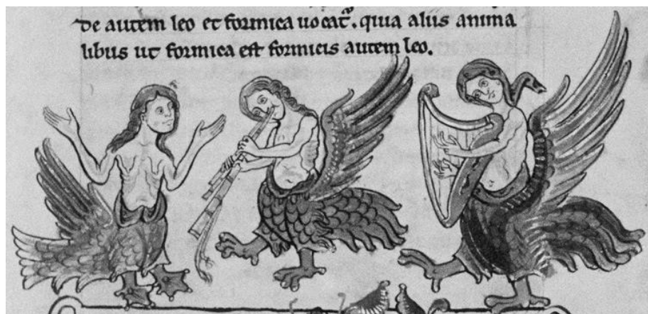
FIG. 2. OXFORD, BODLEIAN LIBRARY, MS BODLEY 602, FOL. 10R.

pipes is in all likelihood nothing other than the result of the work of an inaccurate copyist.