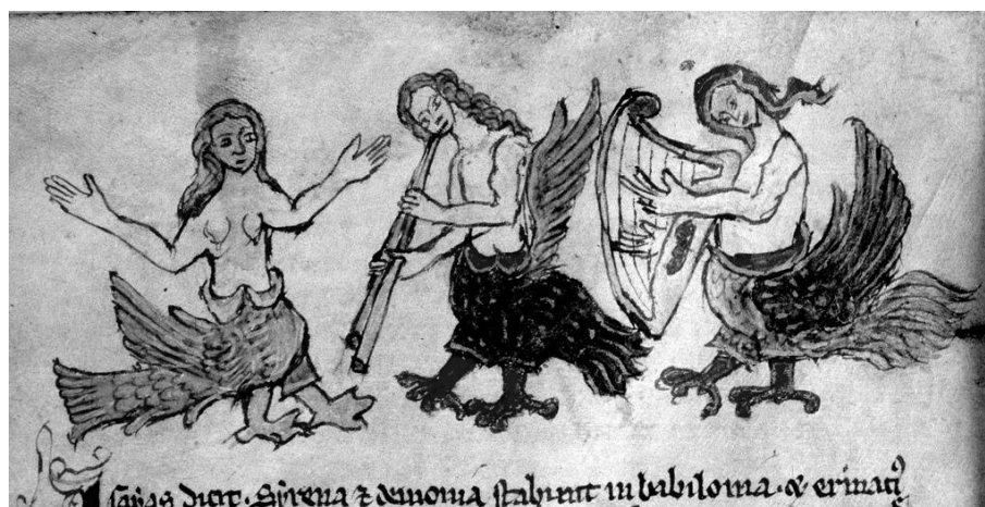
FIG. 3. OXFORD, BODLEIAN LIBRARY, MS DOUCE 88, FOL. 138V.

Perhaps even more importantly, several scholars have argued that the instruments found in Medieval iconography should not be necessarily or automatically understood as direct or indirect reproductions of organological realities: in particular, their nature and function may vary from case to case, and may be partially or exclusively symbolic, especially in the light of the plainly Biblical and Christian context in which they are often found. 95 Indeed, much has been written over the past century concerning the