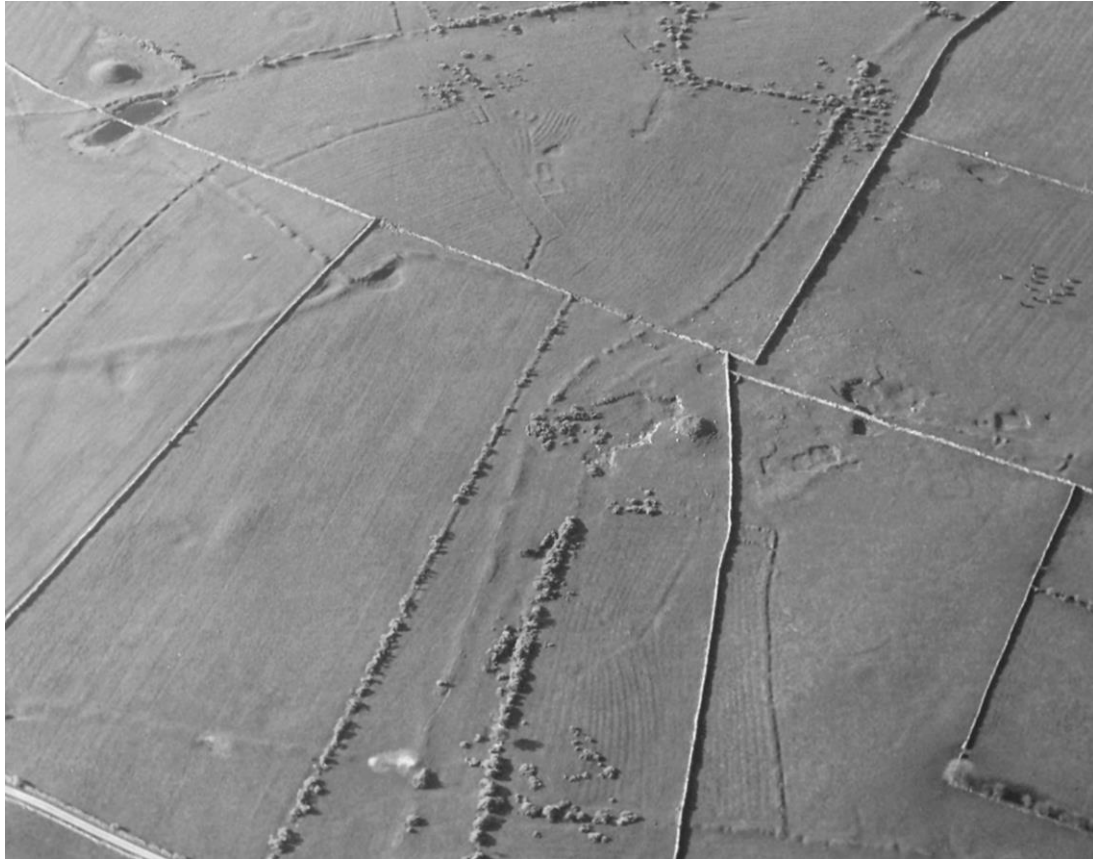
Fig. 3 The landscape of Ard Caoin, showing (at centre) Carn Fraoich, alias Dumha Selga 'the mound of the hunt', where Mac Branáin, keeper of Ó Conchobhair's hounds, died in 1448. The role of the route running north–south and curving around the mound is not known. It may have been processional or possibly used for coursing (Photo: Gerry Bracken, courtesy of the Rathcroghan Project).

ground. 79 There are other insights into the cultural practices of the Meic Branáin as hereditary huntsmen to their lord on the lands of the lucht tige . In 1448, Seán Mac Branáin, keeper of Ó Conchobhair's hounds and leader of his ceatharnaigh , died at Dumha Selga ('the mound of the hunt'). 80 The circumstances of his death are not explained but Dumha Selga is located on Ard Caoin, the assembly place of Machaire Chonnacht.