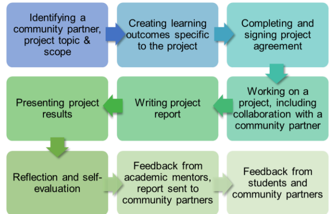
Figure 1. Community engaged building engineering projects methodology.

The projects are carried out following a step-by-step methodology which encourages students' engagement and self-evaluation (Figure 1).