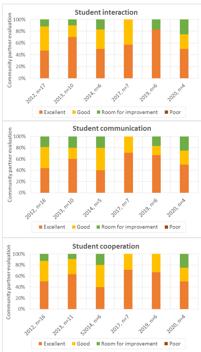
Figure 2. Evaluation by community partners of students' interaction, communication and cooperation.

The results of six feedback surveys carried out among community partners showed that the majority of students' interaction, communication and cooperation was excellent, with approximately 10-20% of partners expressing room for improvement in this aspect (Figure 2). No community partner felt that students interacted, communicated or collaborated in a poor manner through the projects. Furthermore, the majority of community partners found the students' reports very useful and will carry out the recommendations suggested in the reports (Figure 3).