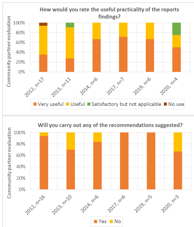
Figure 3. Evaluation by community partners of the usefulness of project reports.

In terms of positive aspect of the project set-up, the community partners mentioned: