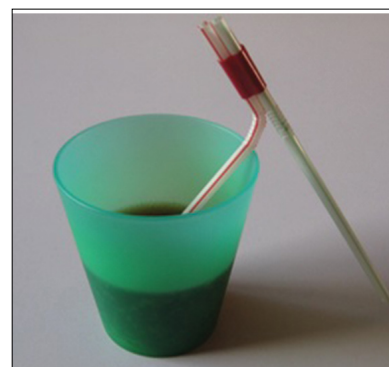
Fig. 3. Beaker with two straws taped together.

A common expression used by people to describe or explain the movement of a fluid in a straw by air pressure is that it is being “sucked up.” This implies that the person is applying all of the pulling force to drink from a straw. However, the movement of water is caused by a pressure