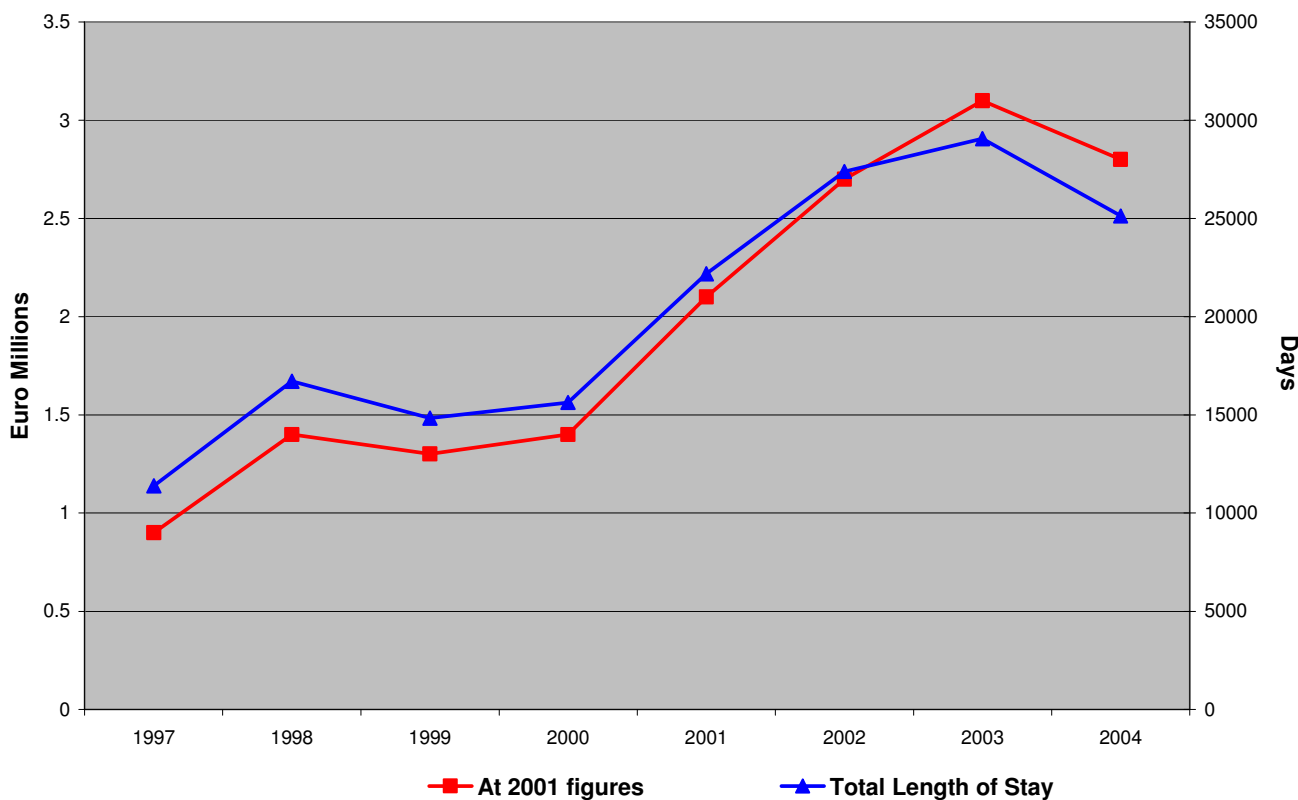
Figure 2 Variable hospital costs and total length of stay from 1997 to 2004 for obesity related conditions.

The code for obesity was most often entered as secondary diagnosis which suggests that the estimates made in this paper are very conservative. Firstly, a secondary diagnosis will less often be coded and treatment will usually be for a related condition rather than obesity. Secondly, the dependency of the analysis on consultants to report obesity, especially to include it as secondary code, will lead to underreporting. As the number of secondary diagnoses increased from 5 to 9 the chance to include obesity as a secondary code also increased and might explain the jump between 2000 and 2001 in the total length of stay (Figure 2). However, the increase continues on over the following years emphasising the underlying increasing trend in obesity related conditions.