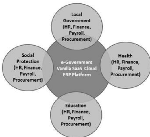
Figure 2. Trial “cluster” systems alignment

One possible avenue for e-Government to leverage the capabilities afforded by the 5-4-3 cloud computing stack model would be, on a trial project basis (figure 2), to transition and consolidate the disparate departmental systems of a number of public sector agencies into a single ERP project in the cloud. This “cluster” of agencies could perhaps implement a ‘vanilla’ ERP cloud SaaS solution on a hosted platform to support finance, payroll, procurement and human resources functions. The benefits of implementing a ‘vanilla’ solution include rapid deployment, minimal configuration and the capability to support standard processes. The overall aim of this trial project would be to deliver prerequisite minimum capability and depending on the results of the trial could provide the foundation for the aligning of public sector legacy systems on a mass scale (figure 3).