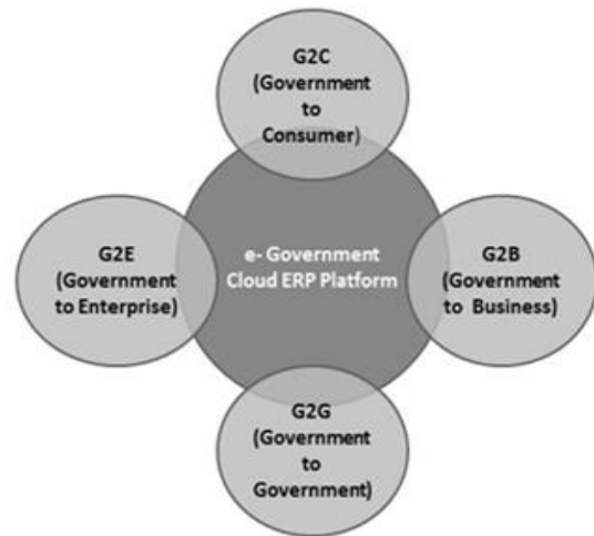
Figure 3. e-Government systems alignment