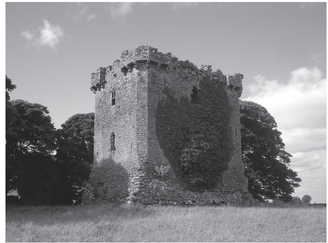
Fig. 2 Shrule Castle, Co. Mayo. Looking north-east.