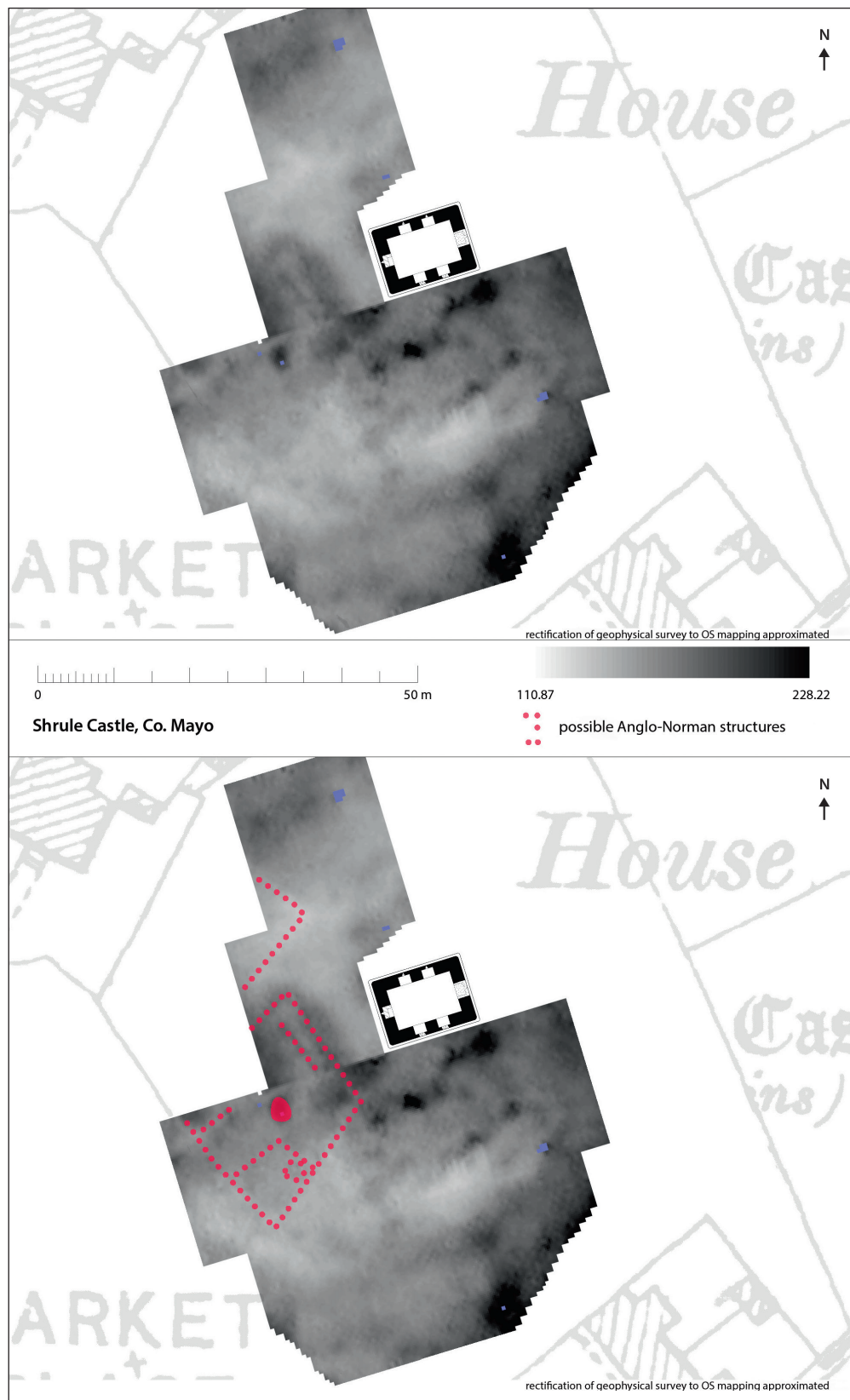
Fig. 4 Earth resistance results Shrule, Co. Mayo. Original results and interpretation. Doc. K. Dempsey and C. McDermott.