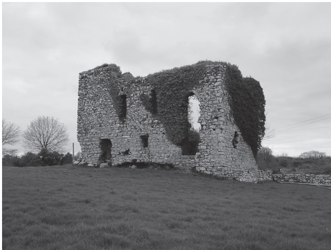
Fig. 1 Annaghkeen Castle, Co. Galway. Looking north-west.