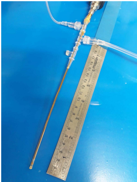
Fig. 1. Ablation applicator used in this study. The monopole antenna is created by exposing the inner conductor of UT-047 coaxial cable for a length of 6 mm immersed in a water-cooled polyamide catheter with outer diameter of 2.3 mm. The length of the ablation applicator is 20 cm from the SMA connector to the feed-point.

Dielectric measurements were carried out in the frequency range from 500 MHz to 4.5 GHz. The setup included a vector network analyser (VNA) (Keysight E5071C ENA, Keysight Technologies, Inc., Santa Rosa, CA,