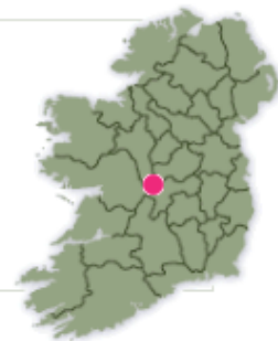
Figure 1: Screen-grab of the Placenames Database of Ireland at www.logainm.ie