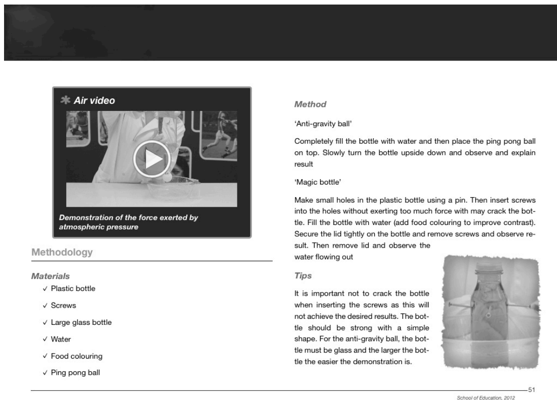
Figure 1. A screen shot of Chapter 12 from the Chemistry Hook iBook: Air