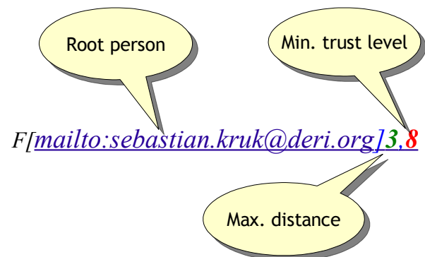
Figure 3: Example of ACL entry in FOAFRealm

One of the key features in D-FOAF/FOAFRealm is fine-granularity of access control lists based on FOAF/RDF graphs. There is no predefined list of groups, realms of users.