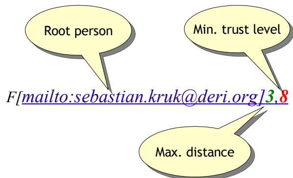
Figure 3: Example of ACL entry in FOAFRealm

One of the key features in D-FOAF/FOAFRealm is fine-granularity of access control lists based on FOAF/RDF graphs. There is no predefined list of groups, realms of users.