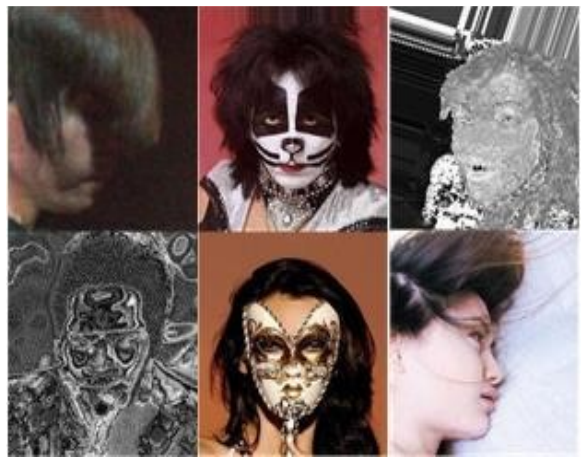
Fig. 2. CelebA samples [12], not detected by the MTCNN [22].