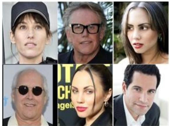
Fig. 3. CASIA-WebFace samples [10], after the pre-processing procedure