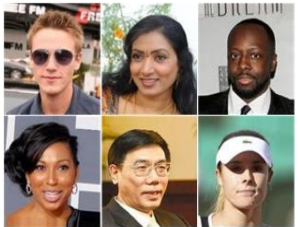
Fig. 4 CelebA samples [12] after the pre-processing procedure.