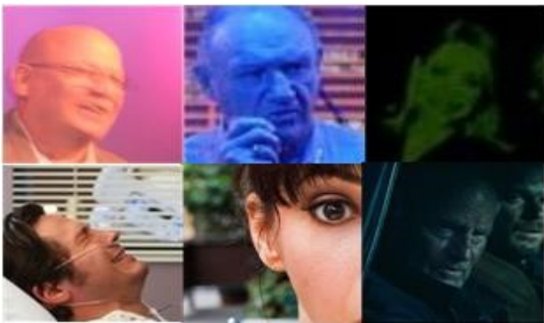
Fig. 1. CASIA-WebFace samples [10], not detected by the MTCNN [22].

With the use of MTCNN to pre-filter the data, it is possible to a certain degree to eliminate many unwanted samples that would not be beneficial for retraining StyleGAN for the task of generating unobscured, human faces. Finally, in Fig. 3 and Fig. 4 a selection of good, high-quality, facial samples from CASIA-WebFace and CelebA are presented after the pre-processing procedure and used to prepare data samples for the main training procedure.