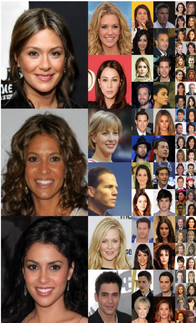
Fig. 5. Uncurated set of images produced by the best StyleGAN model trained with CelebA. The samples are generated with a variation of the truncation trick [25]–[27], \psi = 0.7 for resolutions 4^2 - 32^2 . This figure is similar to the figure (2) from [3]

Below several samples are generated from the trained StyleGAN models. Fig. 5 and 6 show an uncurated set of novel images generated from the trained generator. Fig. 7. shows the effect of applying stochastic variation to different subsets of layers. Fig 8 illustrates the effect of the truncation trick as a function of style scale \psi . The samples in Fig 5, and 8 are generated by the selected StyleGAN model trained with CelebA and Fig 6 and 7 with the selected StyleGAN model trained with CASIA-WebFace. The models used to generate the samples are available in 3 .