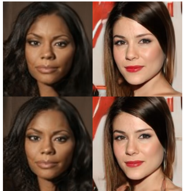
Fig. 7. Effect of noise inputs at different layers of the generator. (a) Noise is applied to all layers. (b) No noise. (c) Noise in fine layers only ( 64^2 - 1024^2 ). (d) Noise in coarse layers only ( 4^2 - 32^2 ). This is similar to figure (5) from [3].