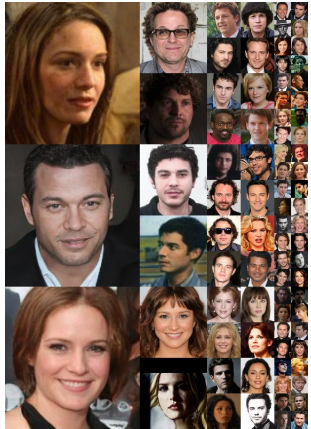
Fig. 6. Uncurated set of images produced by the best StyleGAN model trained with CASIA-WebFace. The samples are generated with a variation of the truncation trick [25]–[27], \psi = 0.7 for resolutions 4^2 - 32^2 . This figure is similar to the figure (2) from [3].