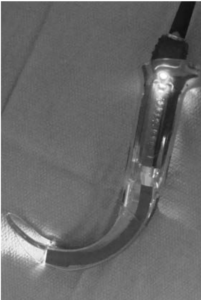
Figure 1 Photograph of the Glidescope laryngoscope. The device is held in the left hand and passed into the mouth over the tongue, and the tip placed in the vallecula or under the epiglottis.

The recent development of a number of indirect laryngoscopes, which do not require alignment of the oral-pharyngeal-tracheal axes, may reduce the difficulty of tracheal intubation in the prehospital setting. Two portable indirect laryngoscopes, which could be included in ambulance equipment inventories, are the Glidescope® (Saturn Biomedical System Inc., Burnaby, Canada) (Figure 1) and the AWS® (Hoya Corporation, Tokyo, Japan) (Figure 2) laryngoscopes. Clinical studies have demonstrated advantages over the Macintosh laryngoscope for both the Glidescope® [6-9], and the AWS® [8,10] laryngoscopes. However, the efficacy of the Glidescope® and the AWS®