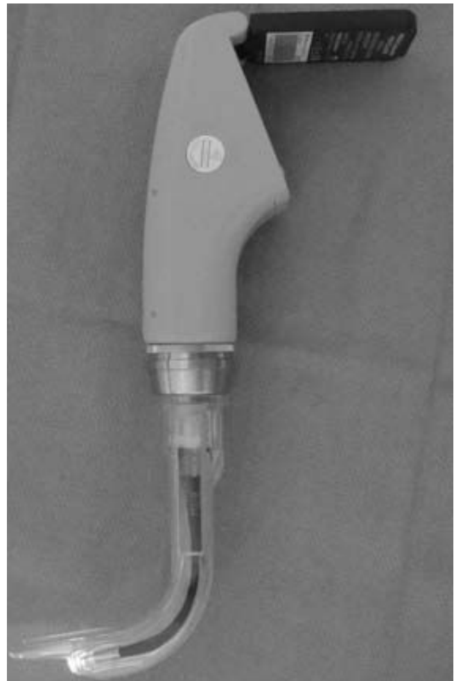
Figure 2 Photograph of the AWS® laryngoscope. The device is held in the left hand and passed into the mouth over the tongue, and the tip is placed under the epiglottis.

when used by APs is not known, and the relative efficacies of these devices in comparison to the Macintosh laryngoscope have not been compared in a single study.