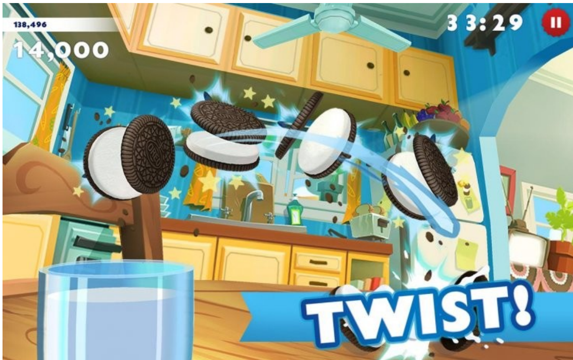
Figure 2: Screenshot of the advergame