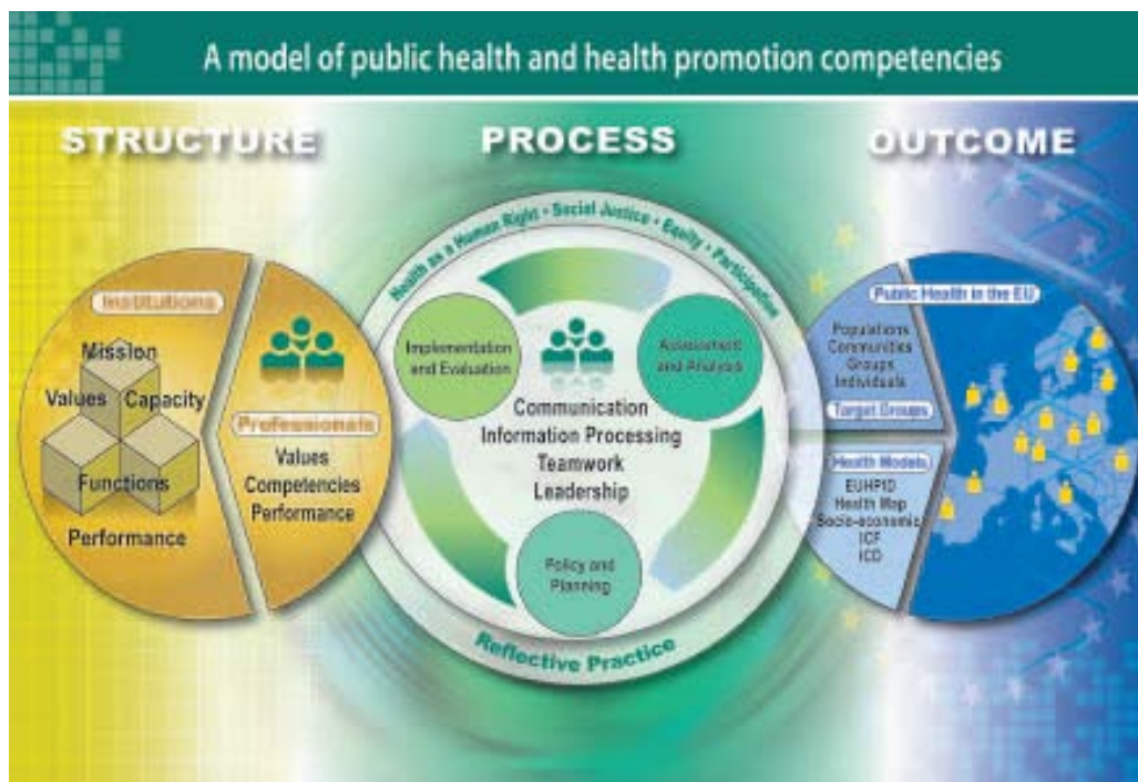
Figure 1 - PHETICE model for analysing public health and health promotion competencies

The cyclical process interacts with the existing structure of institutions and individual professionals and their constituent core components (e.g. missions, values, and capacities for institutions and values, competencies, and performance for individuals) 18 .